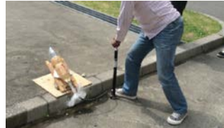
Figure 4 : Water rocket

Water rocket: The third law of motion among Newton's laws shows how things react to the active forces. Actual rockets use gases to launch the satellites in the space. We can, however, demonstrate a similar concept using the water rocket.