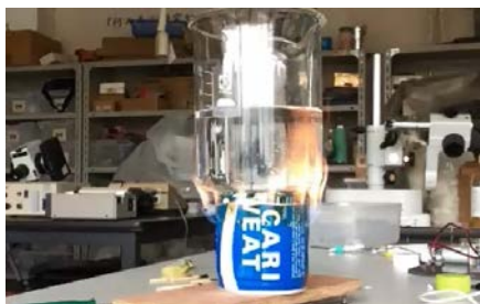
Figure 1 : Bunsen burner

Bunsen burner: In a chemistry laboratory, a Bunsen burner is among necessary equipment for heating. The heating equipment, such as Bunsen burners are expensive. The figure shows the Bunsen burner made from an Aluminum can. It can be created and boil water in a few minutes.