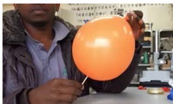
Figure 3 : Ghost balloon

Pinning balloon: Can you pin the aired balloon without busting it? Yes! In mechanics, the concepts of friction forces and stress are discussed. When you put air in the balloon and pin it with a well-pinned material on the side part, it busts.