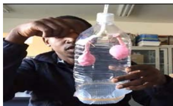
Figure 2 : Lungs model

Lungs model: In biology, some concepts are difficult to teach in the absence of conventional laboratory apparatus. Such concepts, such as how lungs function maybe well demonstrated by using rubber balloons and plastic straw instead of trachea and bronchus. The diaphragm is in control of