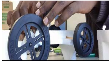
Figure 6 : Car making

Car prototype: In mechanics, the motion of an object is at all of the questionable phenomena among many people. How does the car move, for example? The energy concept is more crucial to make an object move. However, this energy may be in different forms. In our experiment, we made a car using an electric motor.