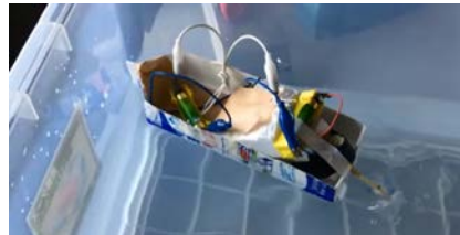
Figure 5 : Boat making.

Boat prototype: In mechanics, there many phenomena explaining many concepts such as force, pressure, and density. The working principle of the boat able to float and moves on water uses both of the above concepts. In making a boat, two major considerations should be taken into accounts. We